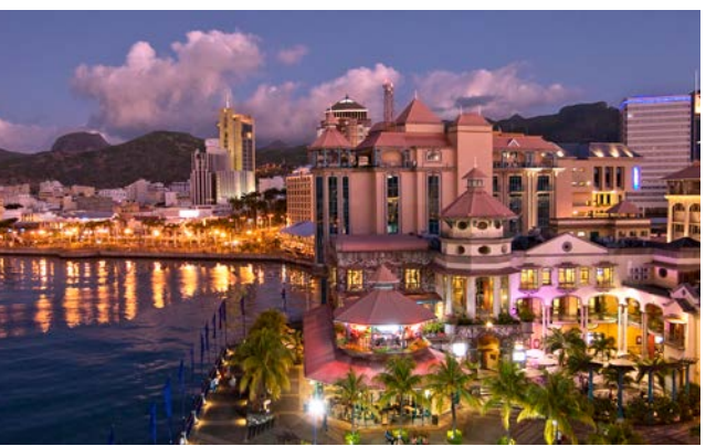
The country is home to a highly experienced financial center

the whole industry and to deliver the services you would expect from a jurisdiction compliant with international norms."