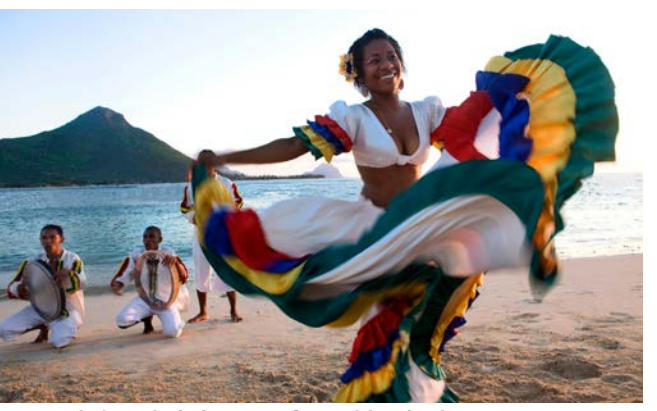
Sega music is a vital element of Mauritius' heritage

the country, from authentic villages to the vibrant, colorful Port Louis, a pedestrian-friendly city that successfully combines modern architecture with historical treasures, such as an 18th-century theater that was one of the first to be built in the southern hemisphere. The capital is also a great place to explore some of Mauritius' many shops, museums, galleries and entertainment venues, or to sample the culinary delights of its restaurants, street-food vendors and markets.