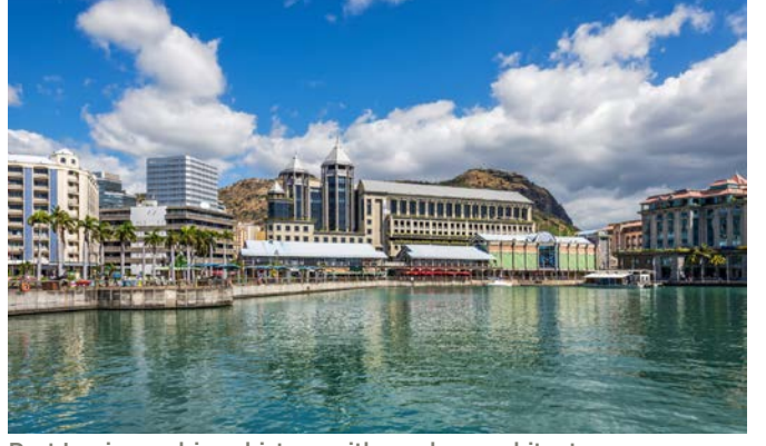
Port Louis combines history with modern architecture

Mungra points out that some foreign investors are involved in the country's energy transformation. "In solar, for example, we have about 11 generating farms. All the projects have been joint ventures between local and international partners, with the technological expertise being provided by the latter, and we see future projects going the same way. Unfortunately, an investment-barrier consultancy carried out by the British High Commission in Mauritius concluded that, while our procurement systems are well based, there is a lack of awareness among potential investors about the possibilities within our energy sector. That's a shame, as there is an ease of doing business in Mauritius that is quite unique." Sewtohul agrees: "The country's commitment to creating a green energy industry is a great opportunity for investors and one they should really make the most of."